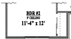
ALTERNET LAYOUT NO BAY ON ROOM