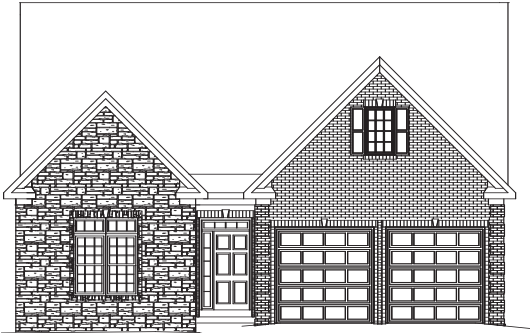
Alternate Front Elevation